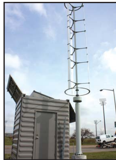
Portable Communication System